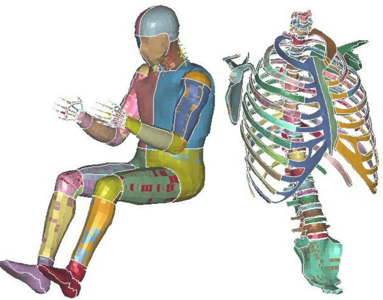
Figure 1: The THUMS human body model. Hole model (left) and spine (right)

The proposed project will use the THUMS model to generate new motion data that will be used as new input to CFD simulations using OpenFOAM (www.openfoam.org) of the spinal canal. The CFD simulations will be carried out using a moving mesh technique where the movement of the boundaries of the CFD simulations will ge given by the FEM simulations .